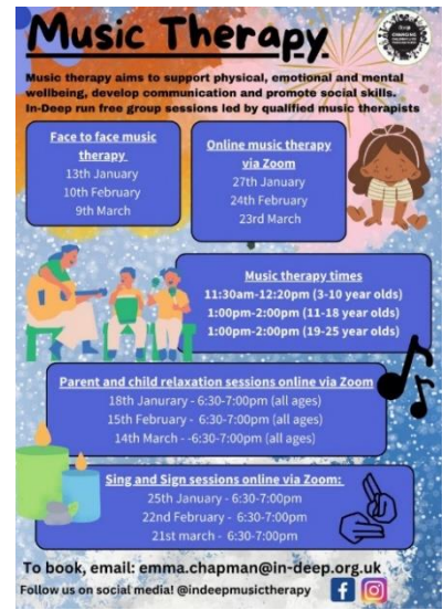
Click here for more information