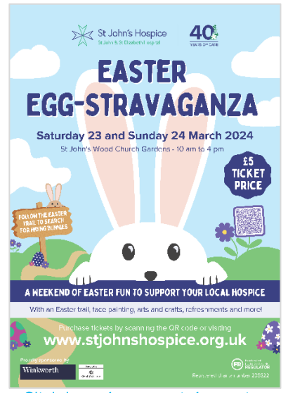
Click here for more information