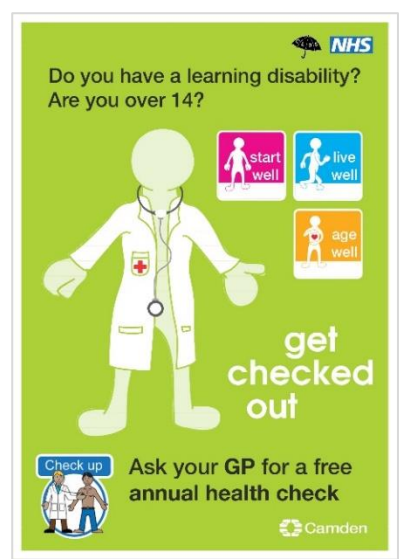
Click here for more information